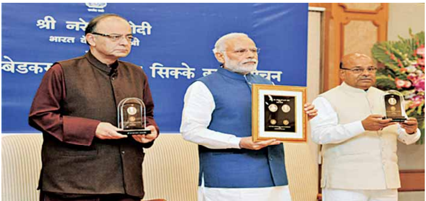
Release of commemorative coins by the Hon'ble Prime Minister on 6.12.2015