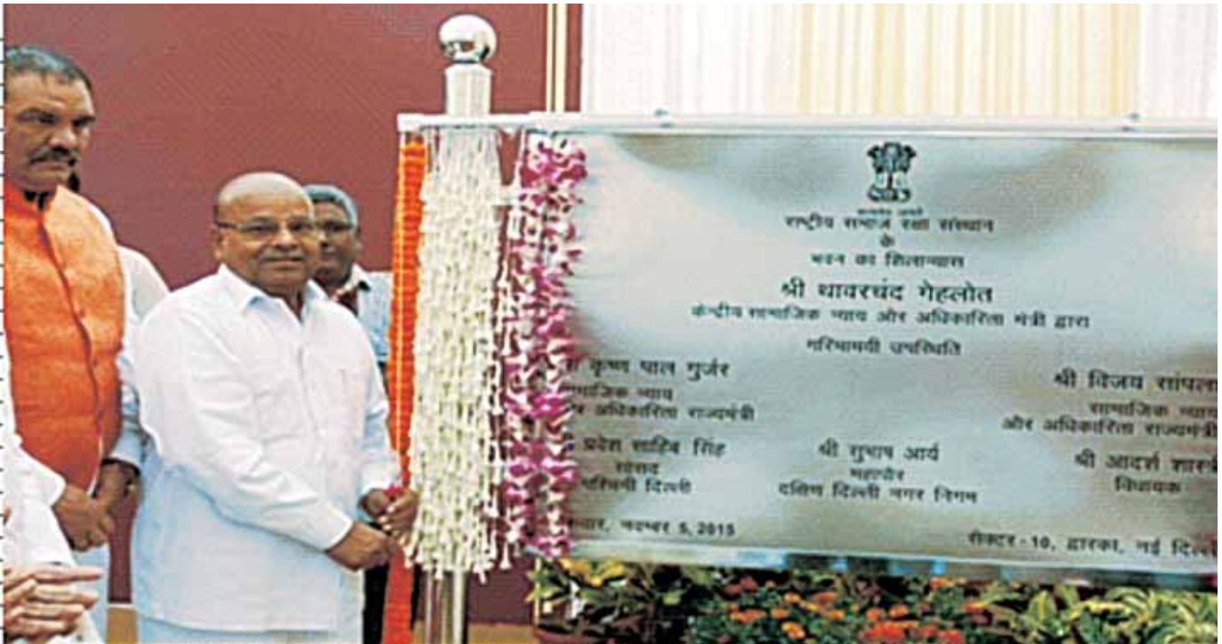
Minister, Social Justice and Empowerment at the foundation ceremony for the new Building of National Institute of Social Defence on 5.11.2015