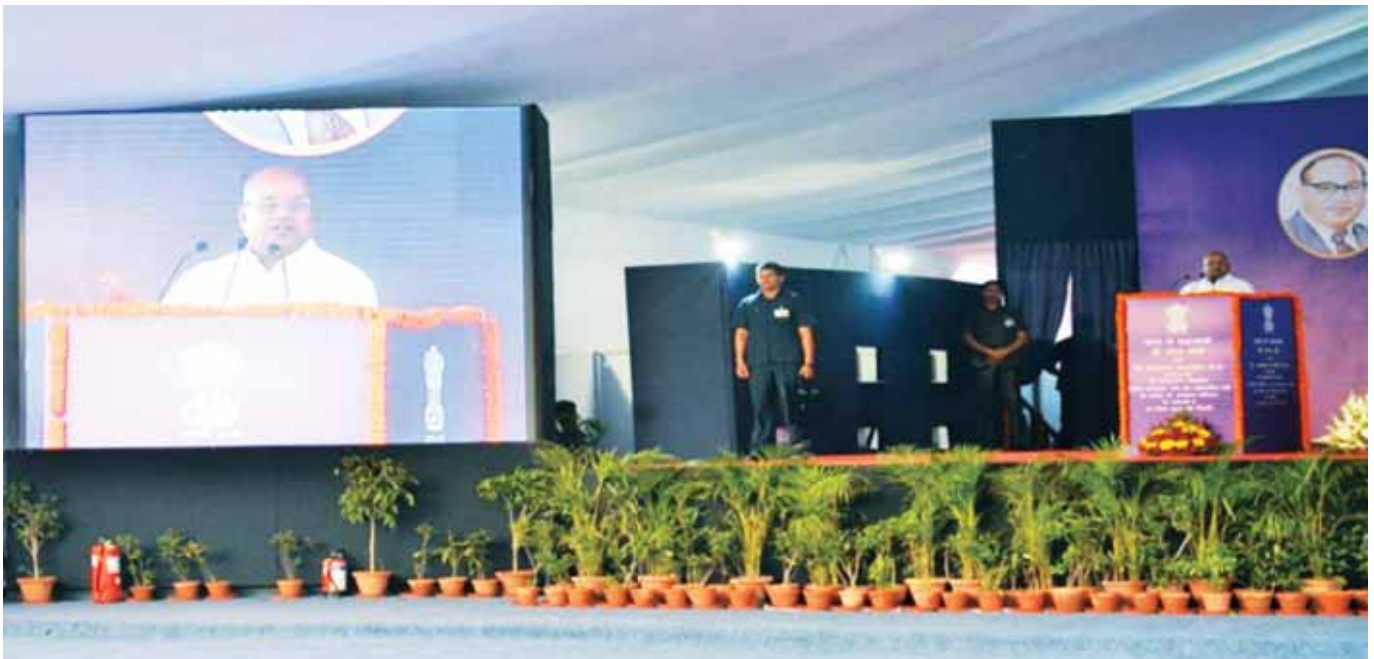
Minister of Social Justice and Empowerment speaking on the occasion of laying of Foundation stone of Dr. Ambedkar International Centre on 20.4.2015