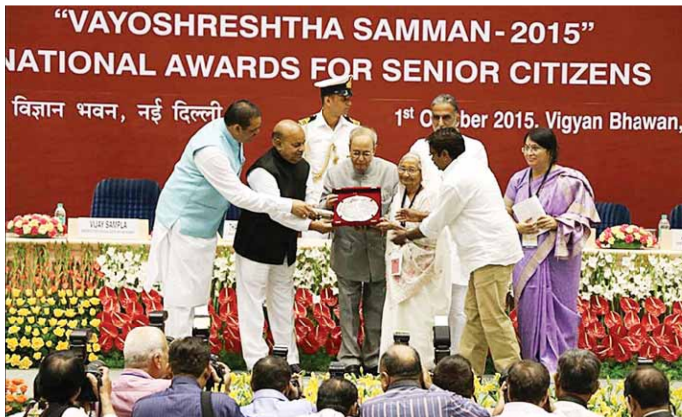
Hon'ble President of India presenting the National Award to an awardee during the Vayoshrestha Sammans – National Award for Senior Citizen on 1st October 2015 at Vigyan Bhawan.