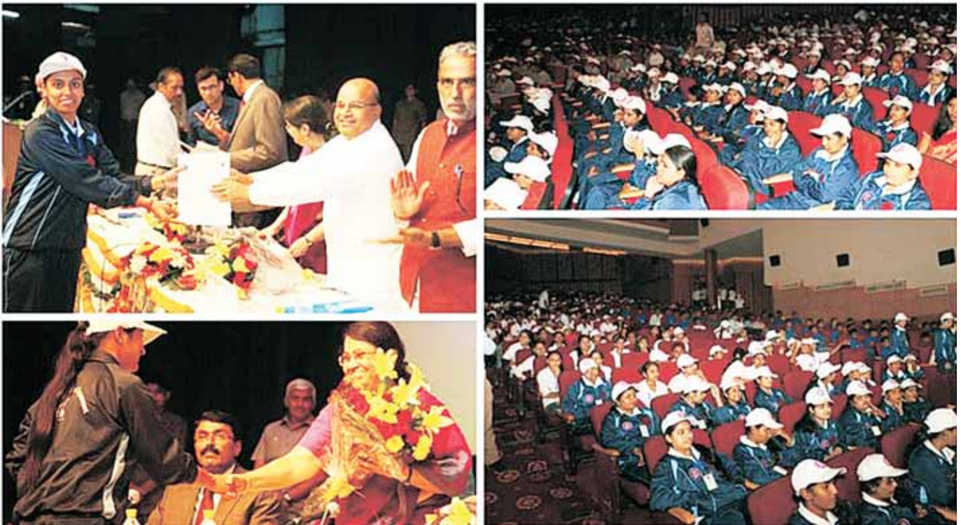
The Commercial driving licensing scheme on skill development for the girls of Safai Karamcharis in which certificates were given to women trainees at Siri Fort Auditorium in Delhi on completion of the training of the 1st batch of trainees.