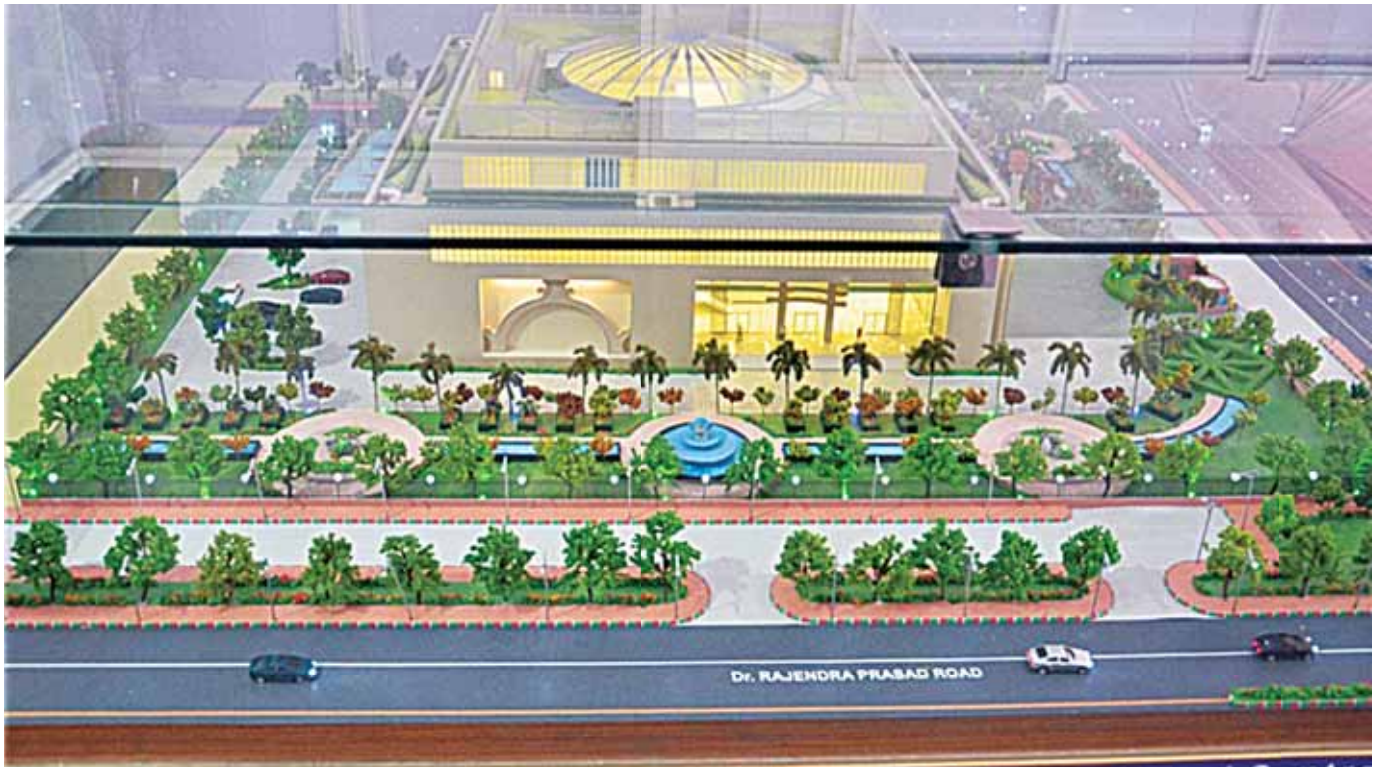
Proposed design of Dr. Ambedkar International Centre at Janpath, New Delhi