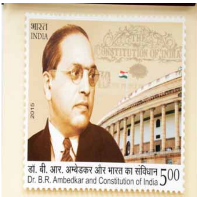
A Commemorative Postal Stamp of Dr. B.R. Ambedkar was released on 30.09.2015