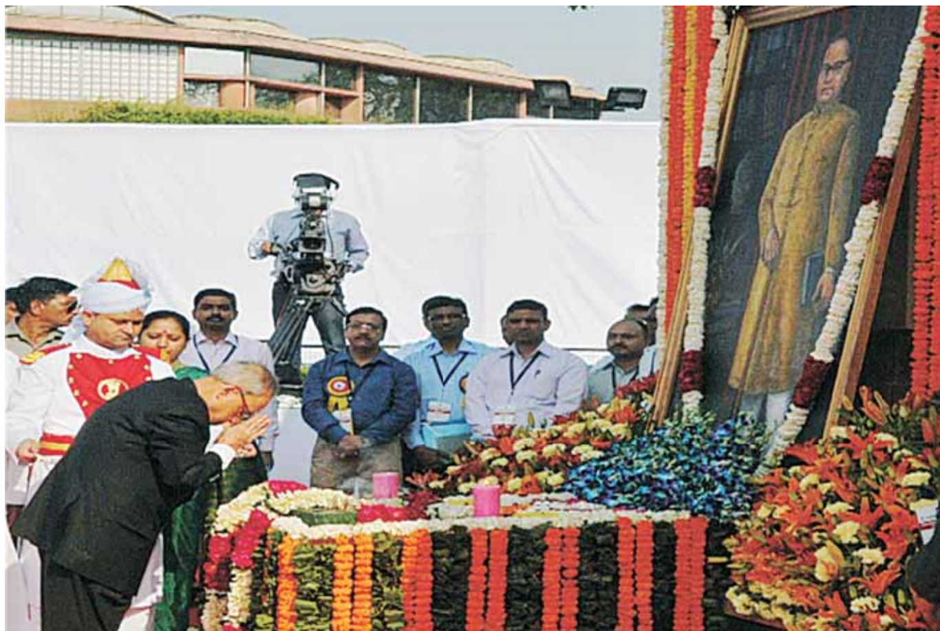
The President, Shri Pranab Mukherjee paying homage to the statue of Babasaheb Dr. B.R. Ambedkar on the occasion of his birth anniversary, at Parliament House, in New Delhi on April 14th 2015

An Executive Committee under the Co-Chairmanship