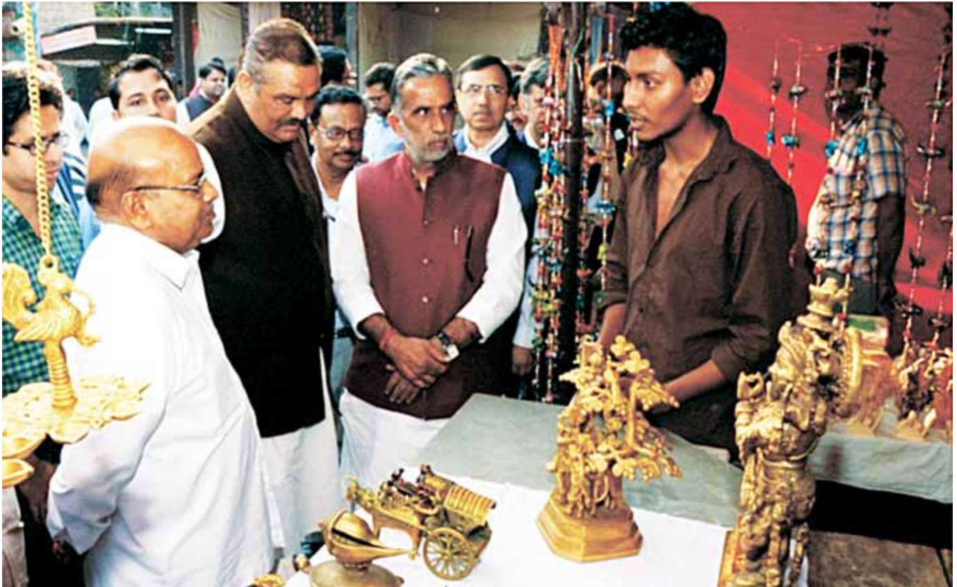
Minister of Social Justice and Empowerment, visiting the NBCFDC stalls at Shilpotsava

NBCFDC also motivates the SCAs to organize or participate in exhibitions to showcase the schemes of the Corporation and also to exhibit the diverse products and services for which NBCFDC has provided financial assistance to the members of Backward Classes in different parts of the Country through