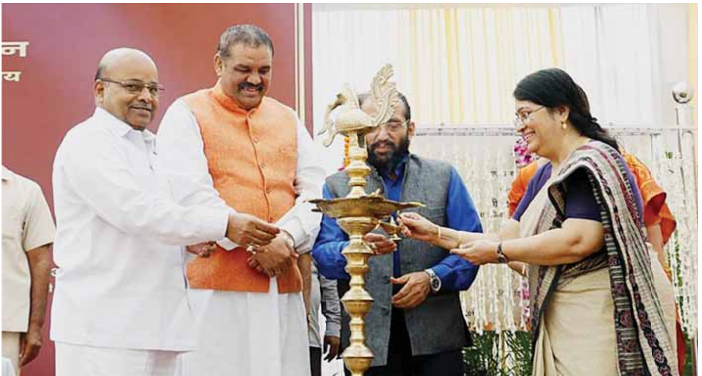
Foundation Stone Laying Ceremony of New NISD Building by Minister of Social Justice & Empowerment Shri Thaawar Chand Gehlot on 5th November 2015.

6.5.4 The Institute, since its inception, has been functioning from West Block-1, R.K.Puram, New Delhi. Delhi Development Authority (DDA) has allotted 2 acres of land at Sector 10, Dwarka to the Institute for construction of institutional building. After seeking necessary approvals from Delhi Urban Art Commission (DUAC) and Delhi Chief Fire Office (DCFO), the Sanction Plan of NISD building has been approved by DDA. Meanwhile, CPWD has also submitted the revised cost estimate of about Rs. 63 crore for construction of building within time frame of 28 months.