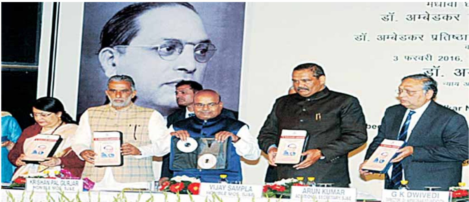
Release of CD of Collected works of Babasaheb Ambedkar by the Minister of Social Justice and Empowerment, Shri Thaawarchand Gehlot, on 3.2.2016