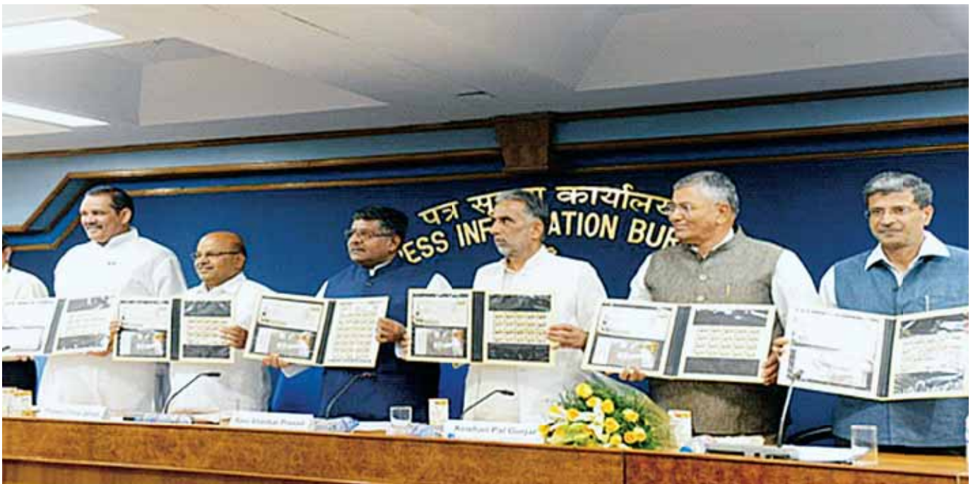
Minister for DEITY Sri Ravi Shankar Prasad alongwith Minister for Social Justice releasing the stamp on Dr. Ambedkar

4.6.1.1.3 To undertake studies and research with an intention to understand, assess and disseminate ideas and thoughts of Dr. B.R. Ambedkar, also to