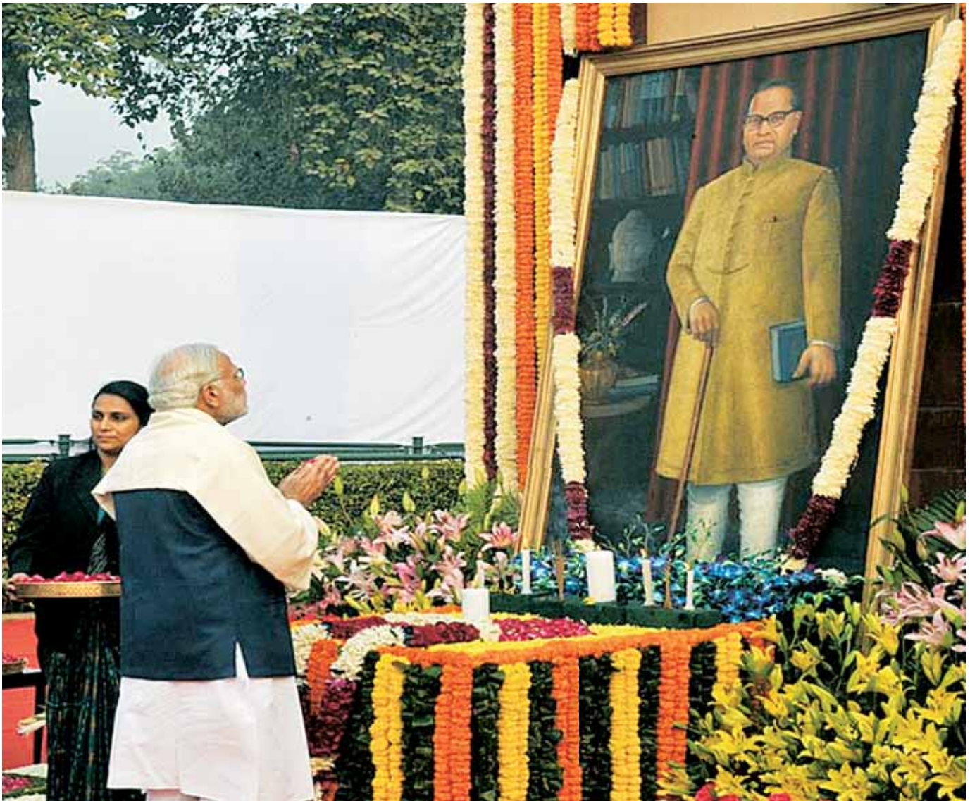
Hon'ble Prime Minister paying tribute to Dr. B.R. Ambedkar on 6.12.2015 in Parliament House Lawns

parties, and a large number of general public also joined them on the occasion.