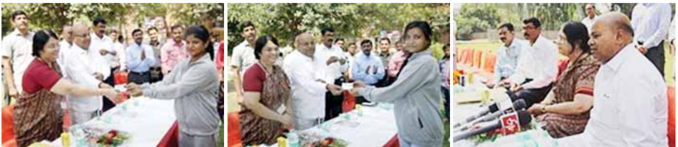
Participants of skill development programme of NSKFDC interacting with Minister and Secretary of Social Justice and Empowerment