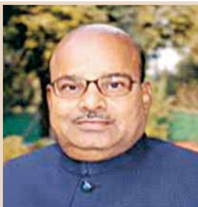
Sh. Thaawarchand Gehlot Minister (26.5.2014 onwards)