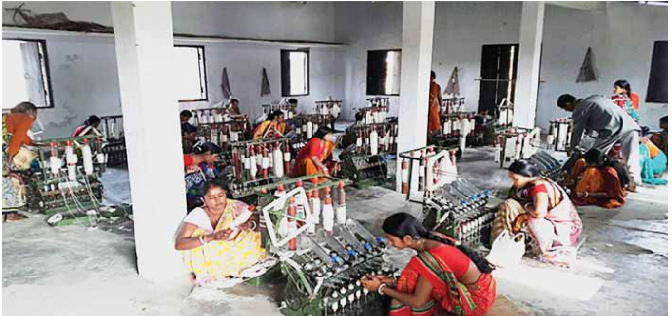
NSFDC's sponsored Training on "Khadi Spinning" at Khadi & Village Industries Commission (KVIC), Baksa District, Assam

The following initiatives have been taken by the NSFDC to improve the outcomes of skill development training programme: