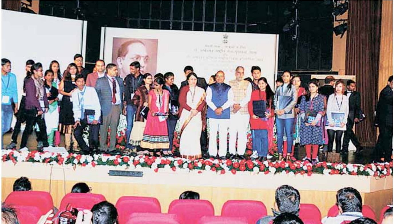
Meritorious SC & ST students awarded by Shri Thaawarchand Gehlot, Minister Social Justice & Empowerment, on 3rd February, 2016

surgery of Kidney, Heart, Liver, Cancer and Brain or any other life threatening diseases which require surgery including organ transplant and Spinal surgery. 100% of the estimated cost of the treatment is released directly to the concerned Hospital, With a maximum ceiling limit as indicated in the following in each case, in the form of a crossed cheque / DD. Heart Surgery of Rs.1.25 lakh, Kidney Surgery / Dialysis of Rs. 3.50 lakh, Cancer Surgery / Chemotherapy / Radiotherapy of Rs. 1.75 lakh, Brain Surgery of Rs. 1.50 lakh, Kidney / Organ Transplant of Rs. 3.50 lakh, Spinal Surgery of Rs. 1.00 lakh and other life threatening diseases of Rs.1.00 lakh. The application shall be forwarded by a local sitting MP(Lok Sabha or Rajya Sabha) or by the DM / Collectors/ Secretaries in charge of Health & Social Welfare Departments of States/UTs and General Body Members of Dr. Ambedkar Foundation. The amount sanctioned during the year 2015-16 was as follows: