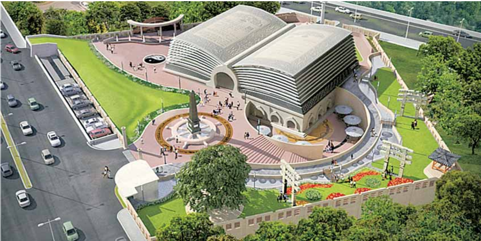
Proposed design of Dr. Ambedkar National Memorial, 26 Alipur Road, Delhi