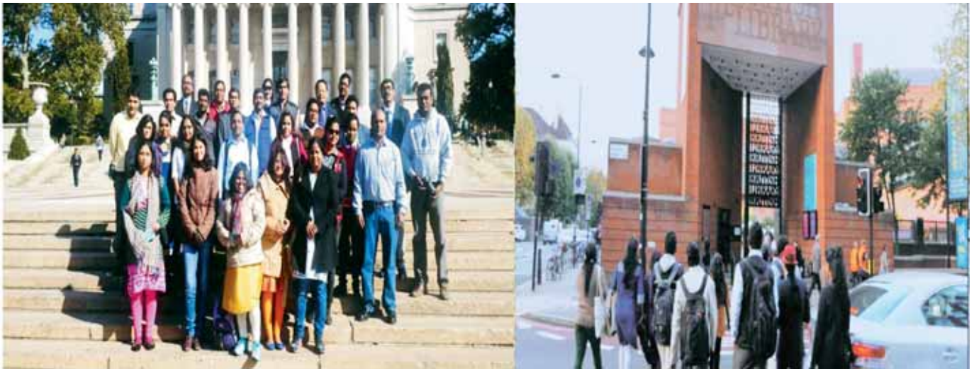
Study tour to Columbia University (USA) and London School of Economics (UK)

various artefacts, photographs and books on Dr. Ambedkar to the Indian High Commission at London to set up a museum in the said property. The museum was inaugurated by the Hon'ble Prime Minister on 13th November, 2015.