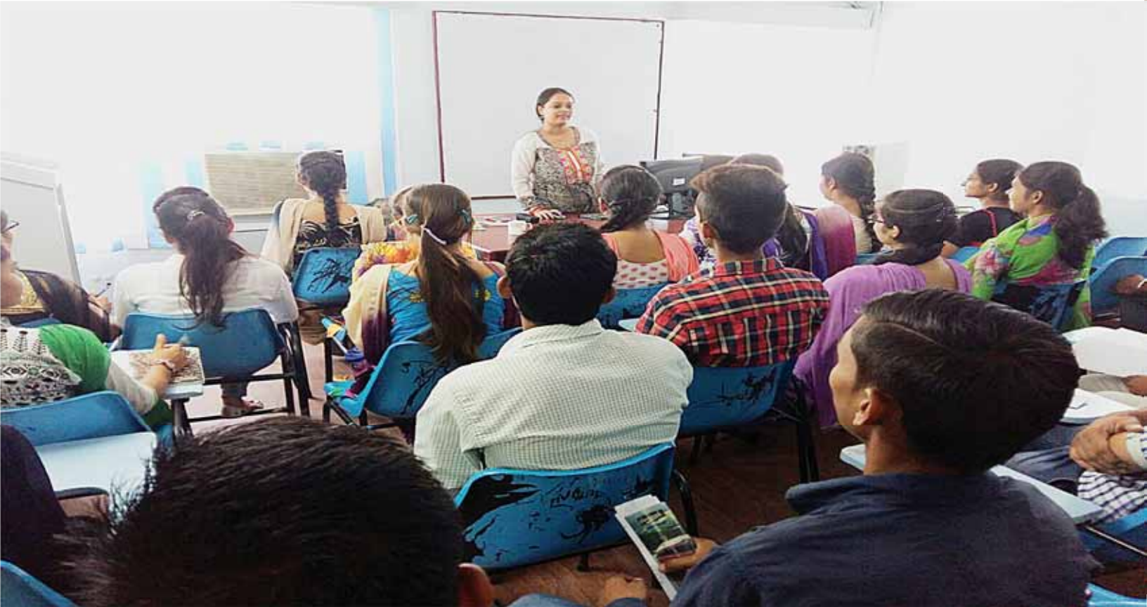
NBCFDC sponsored Skill Development Training Programme through Hatron Approved Work Station, Haryana on 30.10.2015 in Certificate Course in Financial Accounting includes Tally ERP.