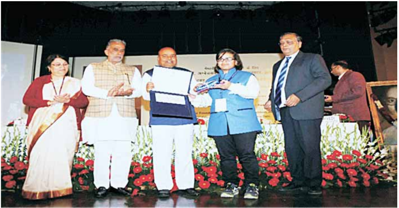
Felicitation of National Essay Competition Winner

organized in most of the Schools affiliated to the CBSE and also in the Kendriya Vidyalayas.