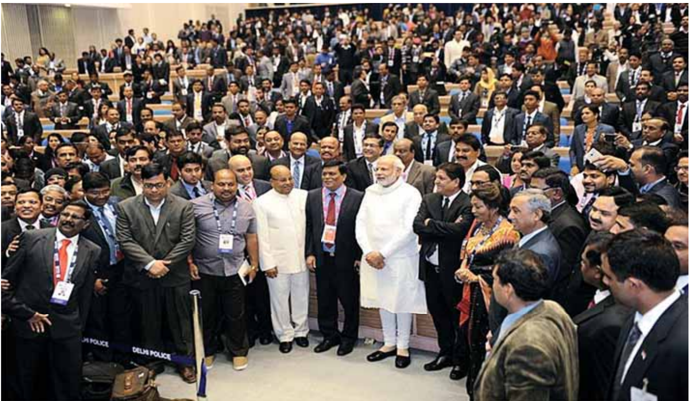
Inauguration of National Conference of Dalit Entrepreneurs by the Hon'ble Prime Minister on 29.12.2015