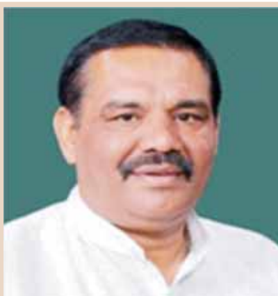
Sh. Vijay Sampla (MOS) (10.11.2014 onwards)