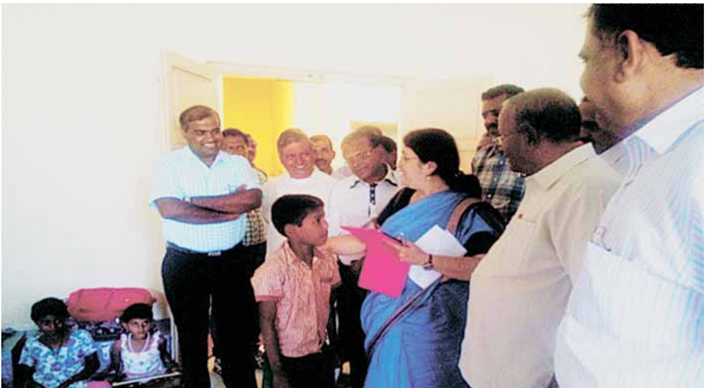
Secretary, SJ&E interacting with the children of DNTs in Karnataka