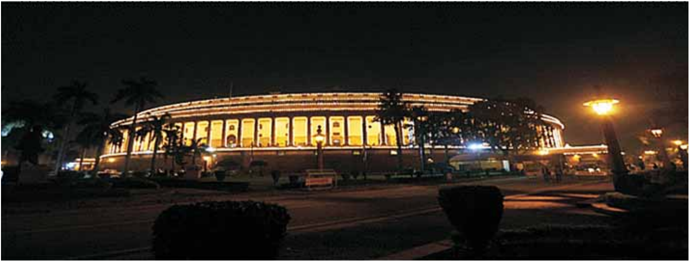
The illuminated Parliament House on 26th November, 2015

to Dr. B. R. Ambedkar, while celebrating 'Constitution Day'. The Hon'ble Members of Parliament while recollecting the role of Dr. Ambedkar in the Constituent Assembly and later as Minister in the Union Cabinet paid homage to him.