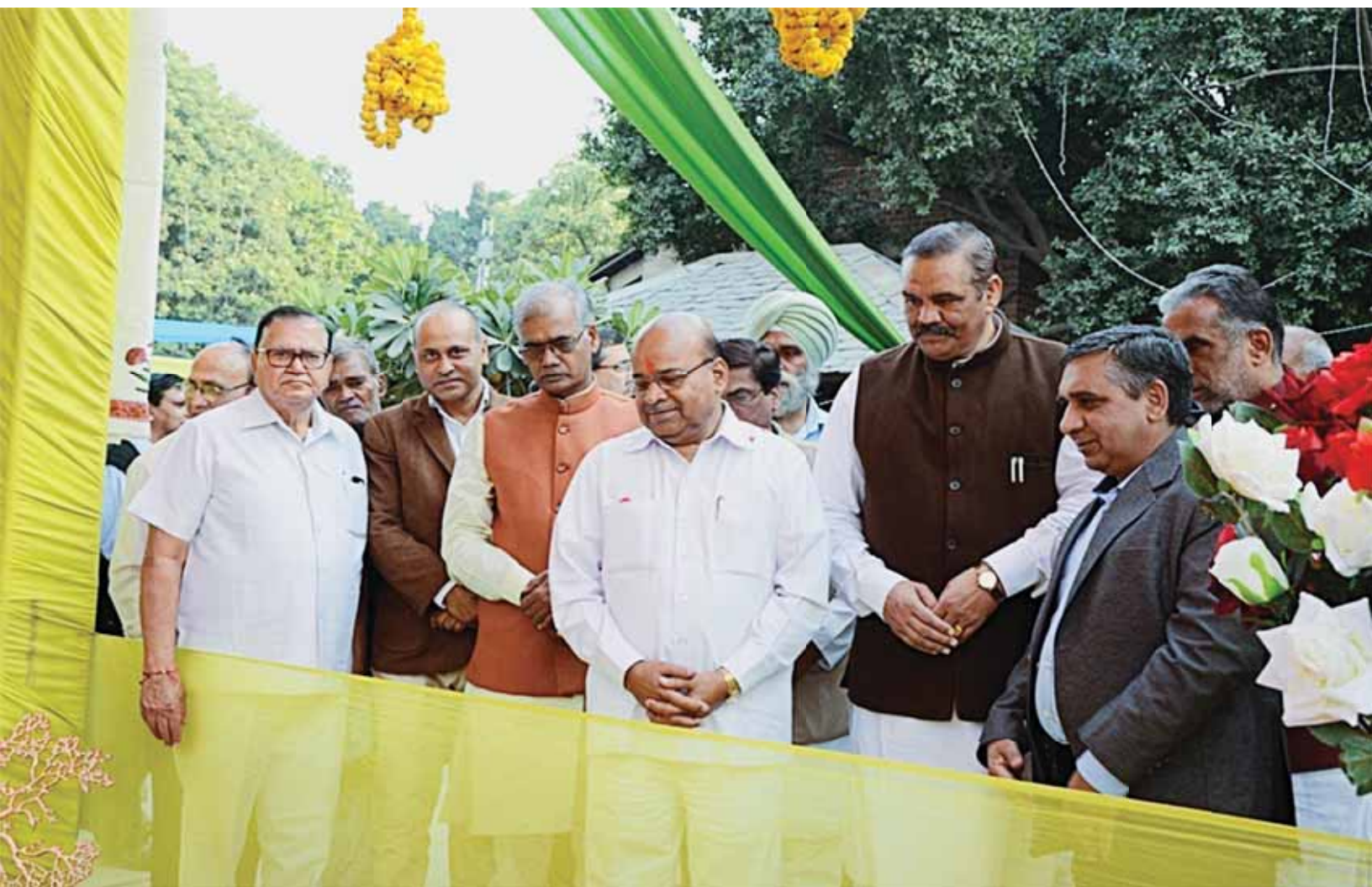
Minister for Social Justice at Shilpotsava 2015, INA New Delhi