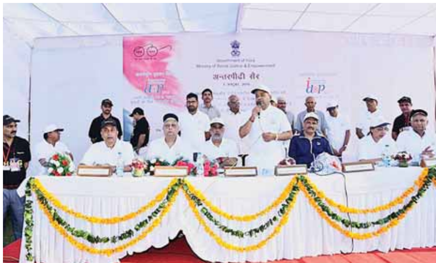
Minister of Social Justice & Empowerment, Shri Thaawar Chand Gehlot addressing the Inter-Generational Walkathon at India Gate on 1st October 2015