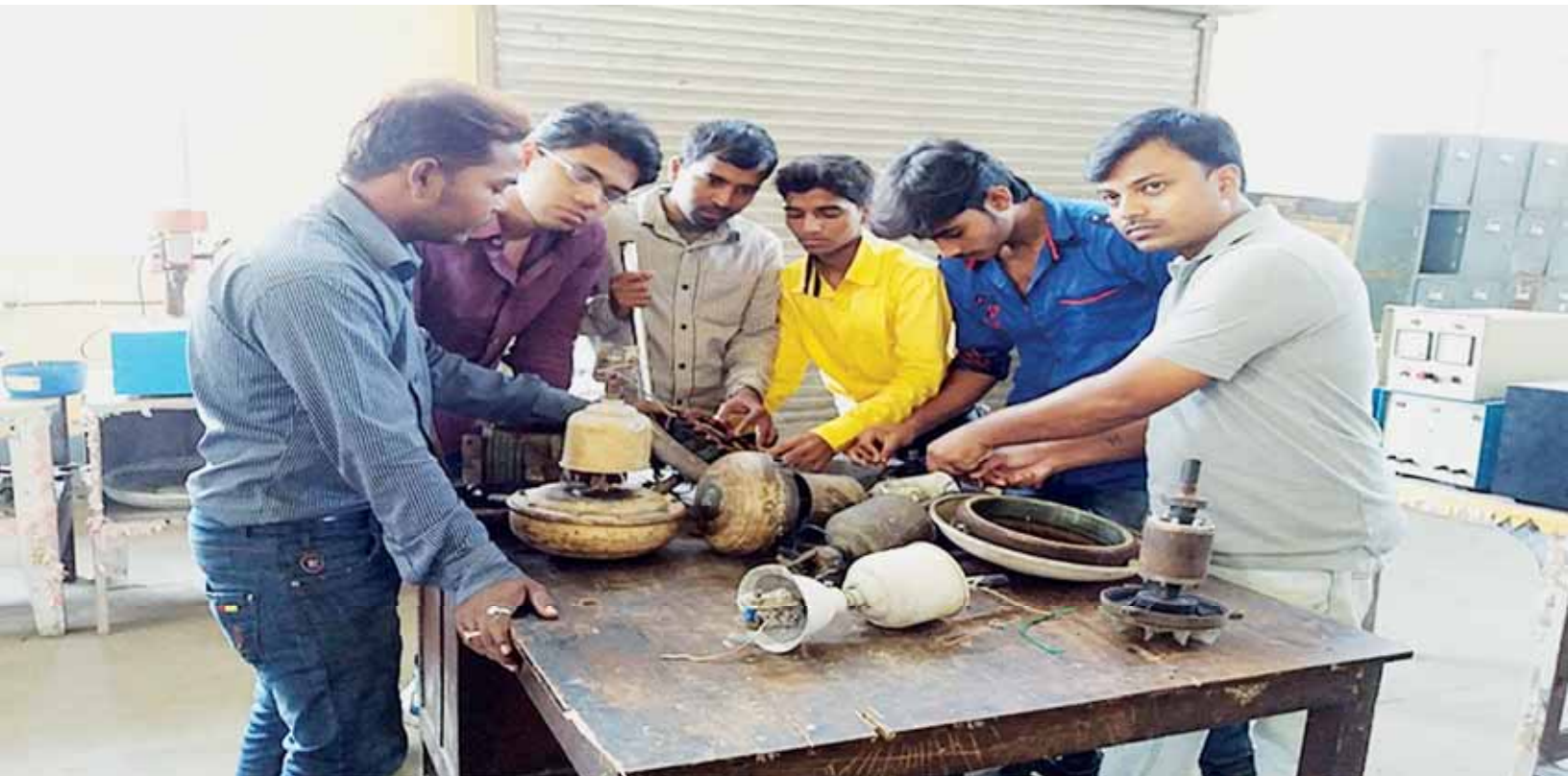
NBCFDC sponsored Skill Development Training Programme through NSIC, Howrah on 08.09.2015 in Electrician.

The list of training courses and beneficiaries trained during 2015-16 (upto 31.12.2016) may be seen at Annexure 7.3.