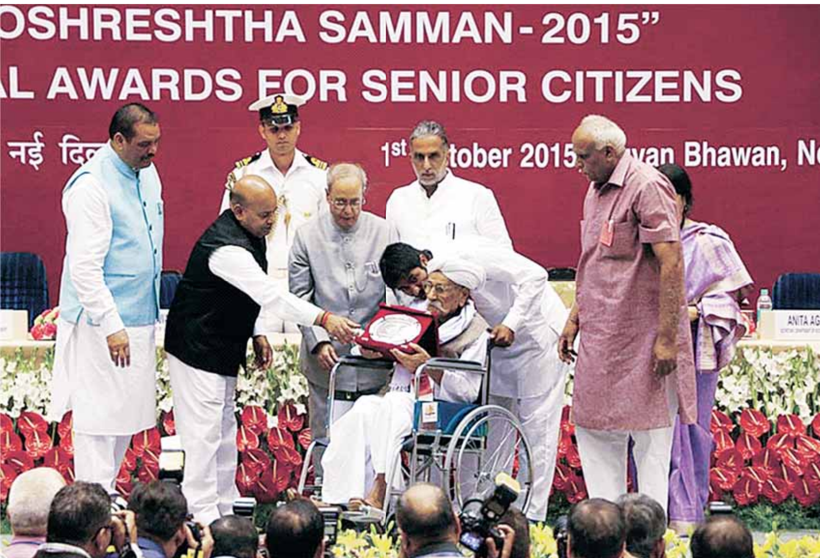
President of India Sh. Pranab Mukherjee conferring the "Vayoshreshtha Samman"-2015

The foundation laying ceremony for the new Building of National Institute of Social Defence was presided over by the Hon'ble Minister, Social Justice and Empowerment on 5.11.2015 at Dwarka, New Delhi.