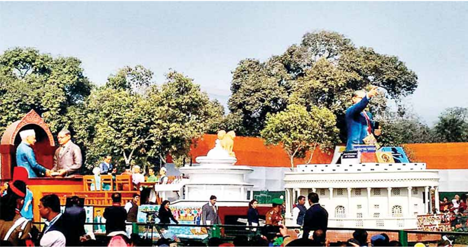
Dr. Ambedkar Tableau on 26.01.2016