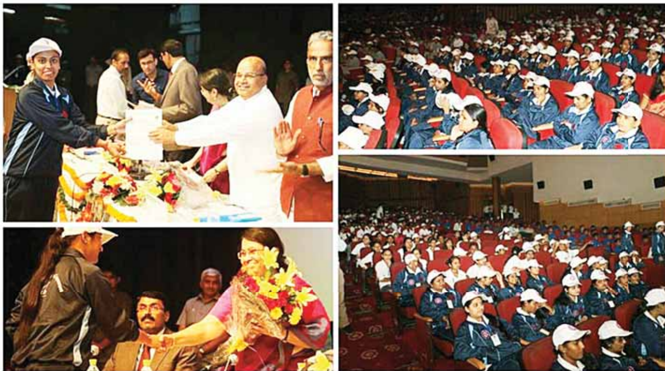
Women trainees of NSKFDC Commercial M. driving course receiving certificates at Siri Fort Auditorium