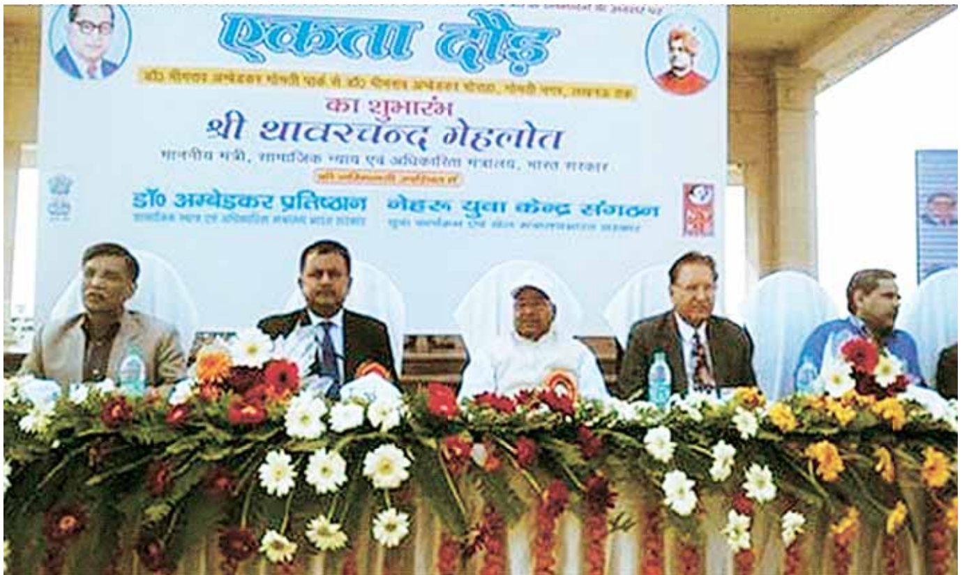
Run for National Unity inaugurated by the Minister of Social Justice and Empowerment, Shri Thaawarchand Gehlot held on 12.01.2016 at Lucknow, U.P.

should be continued every year. The Quiz competition was organized by Babasaheb Ambedkar University, Lucknow. The BBAU has created a website www.dafquiz.in and it was online w.e.f. 1st January, 2016. The registration was open till 8th January, 2016. Detailed advertisements were also issued throughout the country. The online test was held on 16th January, 2016 between 12.00 pm to 01.00 PM. On the basis of results the Prizes are being given to the best three winners of each state and three National Winners, selected through the competition.