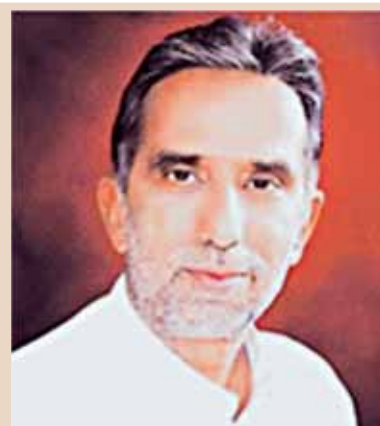
Sh. Krishan Pal Gurjar (MOS) (10.11.2014 onwards)

1.5.2 The Organizational set up of the Department of SJ&E is at Annexure-1.2 .