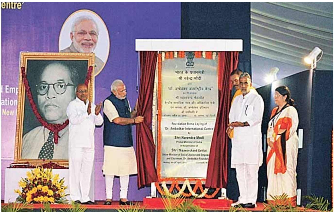
Hon'ble PM inaugurating the Dr. Ambedkar International Centre at Janpath New Delhi

Book fairs / exhibitions: Dr. Ambedkar Foundation participated in New Delhi World Book Fair and 1 Delhi Book Fair.