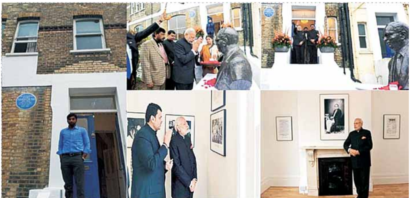
Prime Minister inaugurates Dr. Ambedkar Museum at 10, King Henry's Road, London on 13.11.2015

26th November, 1949. The Government of India declared 26th November as 'Constitution Day'. The programs conducted by various Ministries/ Departments were celebrated throughout the Country and Indian institutions abroad. The Parliament House was illuminated on the first 'Constitution Day' i.e. 26th November, 2015. First two days of the winter session of Parliament were dedicated