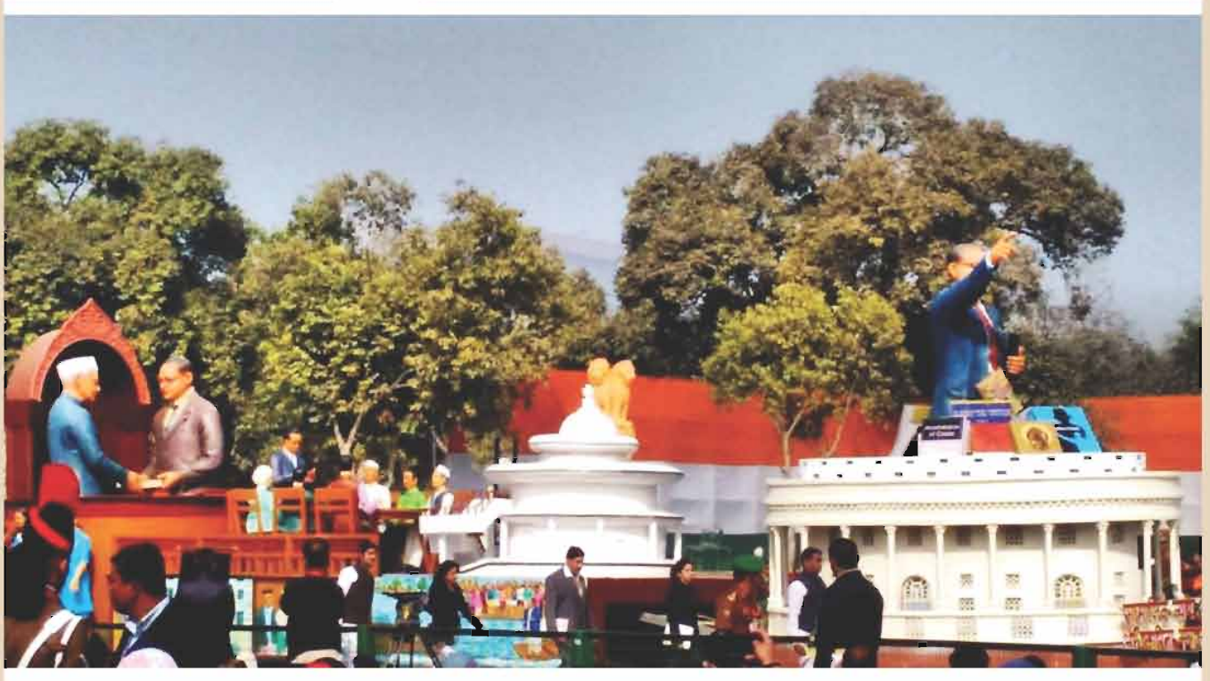
The Tableau of the Ministry of Social Justice and Empowerment on Dr. B.R. Ambedkar in The Republic Day Parade - 2016 at Rajpath, New Delhi